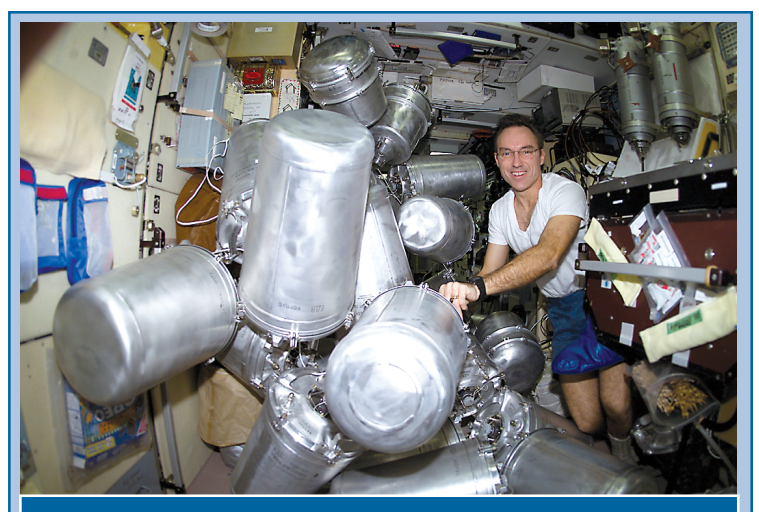
Astronaut Carl E. Walz, Expedition Four flight engineer, catalogs canisters of water in the Zvezda Service Module on the International Space Station.

tion-reverse osmosis system. The technique of rotating filtration had been applied to microfiltration, but never to reverse osmosis due to technical issues stemming from the pressures involved.